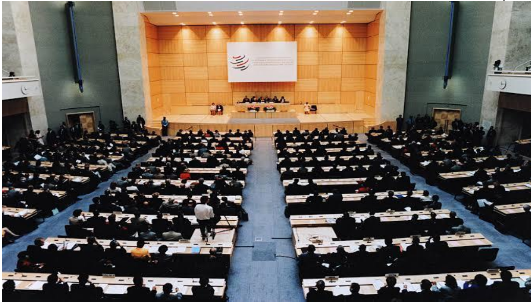
The World Trade Organization Ministerial Conference of 1998, in the Palace of Nations (Geneva, Switzerland).

While the WTO is seen by its members to work well, it is worth bearing in mind that its negotiations are long and arduous. As an organisation, it facilitates world trade but it does not set the tariff or tax rates that make trading expensive. Its members and their willingness to negotiate with each other dictates how successful or not the organisation will be in the future.